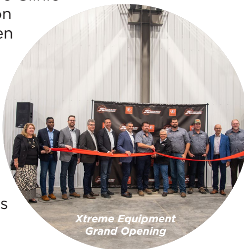
Xtreme Equipment Grand Opening