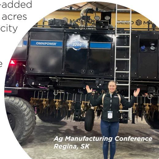
Ag Manufacturing Conference Regina, SK

"Non-exempt" developments are for projects that pay taxes. "Exempt" developments are for projects do not pay taxes.