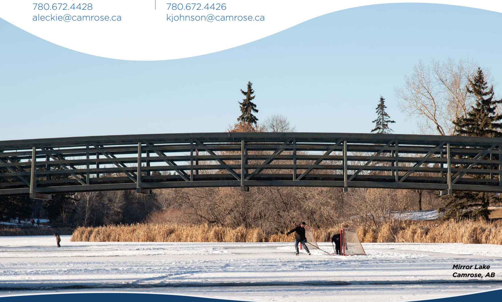
Mirror Lake Camrose, AB