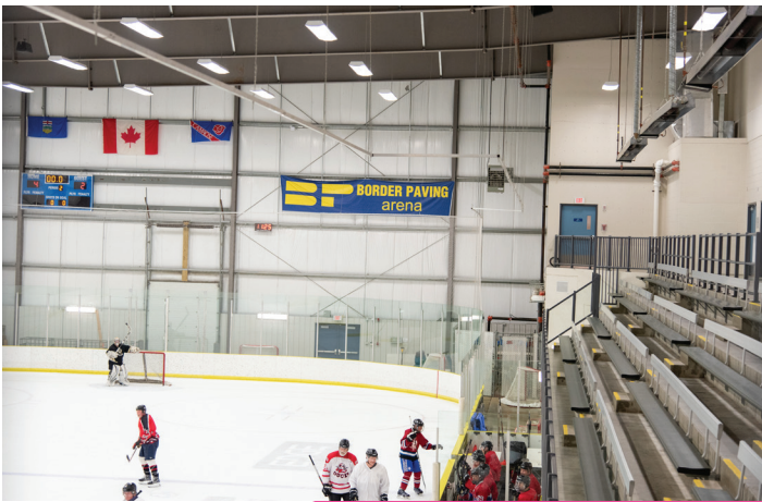
Ice Time Utilization | Border Paving Arena