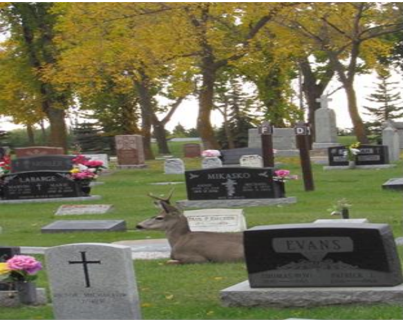
Camrose Valleyview Cemetery