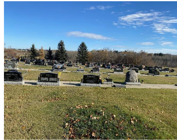
Camrose Valleyview Cemetery

For further information on the different alternatives and pricing, contact Community Services.