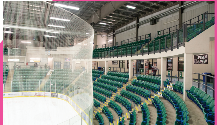
Ice Time Utilization | Encana Arena

Camrose's premier event arena is integral to our hockey programs. The spectator events arena is integral to hosting world-class recreation and entertainment events.